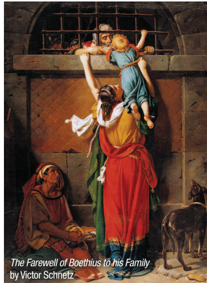
The Farewell of Boethius to his Family by Victor Schnetz

a hypnotic effect over cultures, leaving them in supine surrender. In the classical tradition, rights bear a muscularity which generates all the virtues that ennoble man. Equal